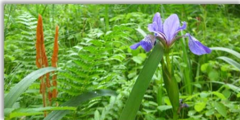
Blue Flag Iris with Cinnamon Fern